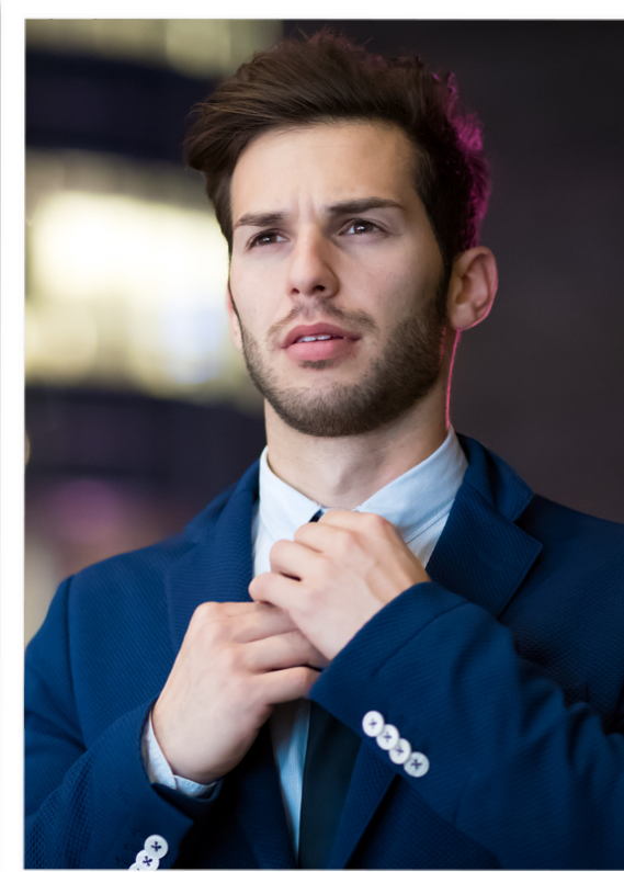
ASKENAZ FOUNDER & CEO